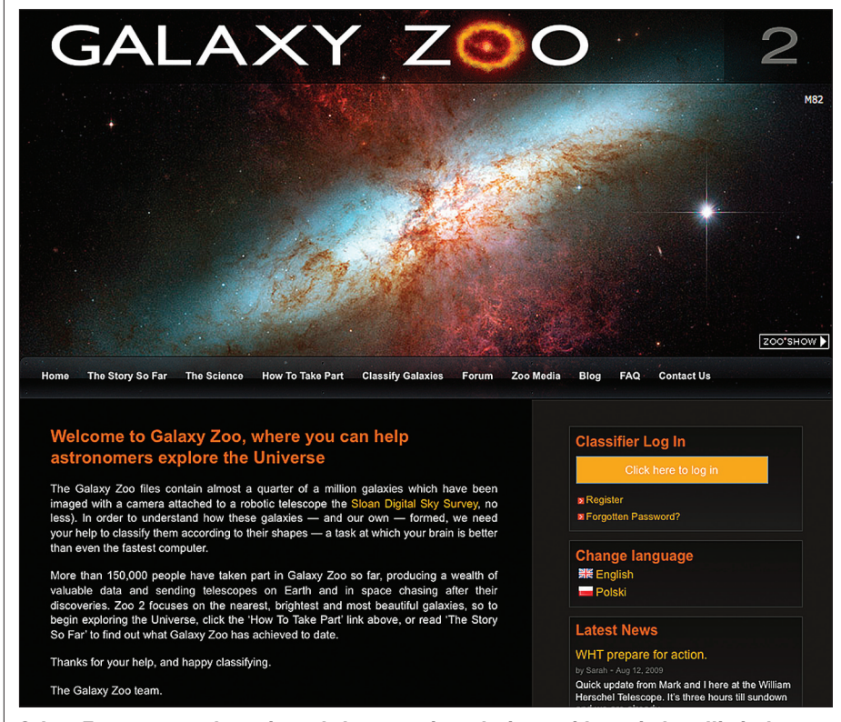
Galaxy Zoo uses crowdsourcing to help categorize galaxies as either spiral or elliptical.

In addition, it's essential to be able to search in less formal ways, such as by habitat type, mating behavior, or leaf shape, characteristics that aren't often described by a standardized set of terms. That's a particular issue for one of EOL's partner efforts, the Biodiversity Heritage Library (BHL), a collaboration of 10 natural history museum libraries, botanical libraries, and research institutions in the U.S. and the U.K. that has put nearly 15 million digitized pages from 37,000 books online. Although optical character recognition software has become reliable, scanning millions of pages is labor-intensive and time consuming, says Chris Freeland, BHL's technical director and manager of the bioinformatics department at the Missouri Botanical Garden in St. Louis. Someone—usually a volunteer student—must turn the pages of every book and correctly position them for the camera. After that phase, though, the digitizing process is automated and efficient. Typewritten or commercially printed material is optically well