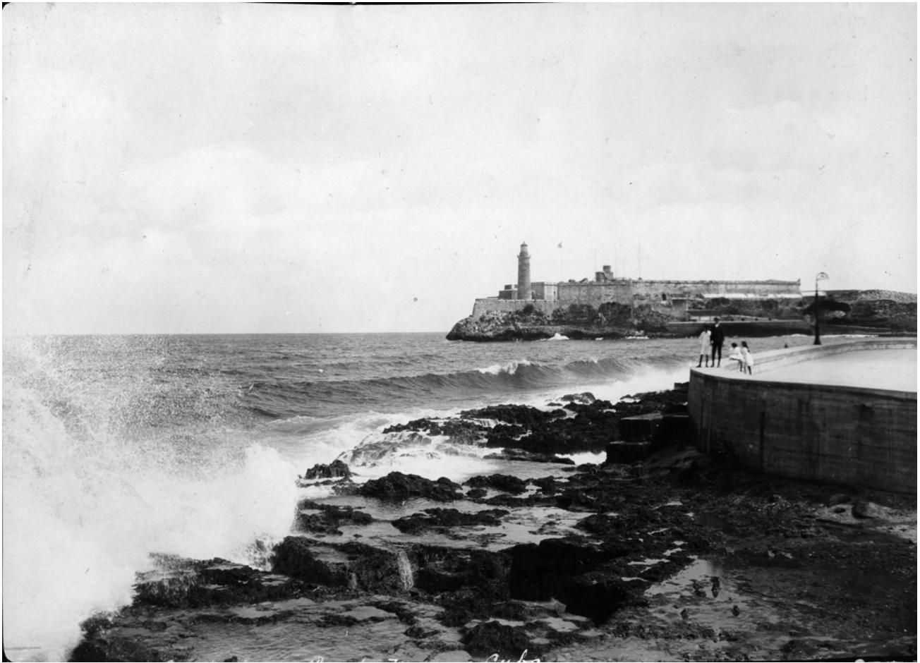
Figure 1 Morro Castle from Prado. Littoral species such as Ligia exotica are found in habitats like this, on rocks and piles just above the water in harbors.

The Milwaukee Public Museum (MPM) collections include historic photographs taken by Sumner W. Matteson (1867-1920), a freelance photojournalist. Matteson took a steamer from New York to Havana, Cuba in late February 1904 (Casagrande and Bourns 1983). There he traveled from Pinar del Rio and Isla de Pinos on the southwest to Baracoa and the mouth of the Yumuri on the northeast. Several photographs taken on this journey are used here to illustrate some of the major habitat types for West Indian oniscideans.