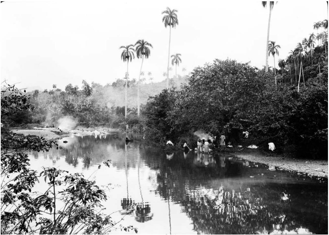
Figure 3 Near mouth of the Yumuri River near Baracoa (northeast coast). Sumner W. Matteson, 1904 (MPM 45140). Vandel (1981) gives this riparian habitat "Rio Yumuri, Oriente Province" as the type locality for Parapacrosia negreai .