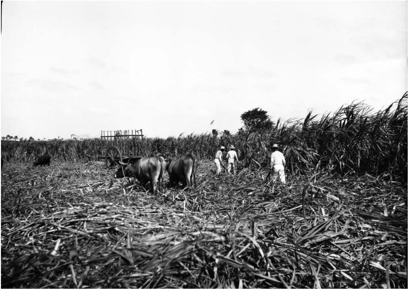
Figure 5 Sugar cane harvesting. Sumner W. Matteson, 1904 (MPM 45024). Much of the natural landscape of the West Indies has been turned to agricultural use, including sugar cane cultivation. These and similar habitats may shelter oniscideans such as Ethelum americanum , which Dollfus (1896) reported from a sugar cane field, under decaying cane leaves.