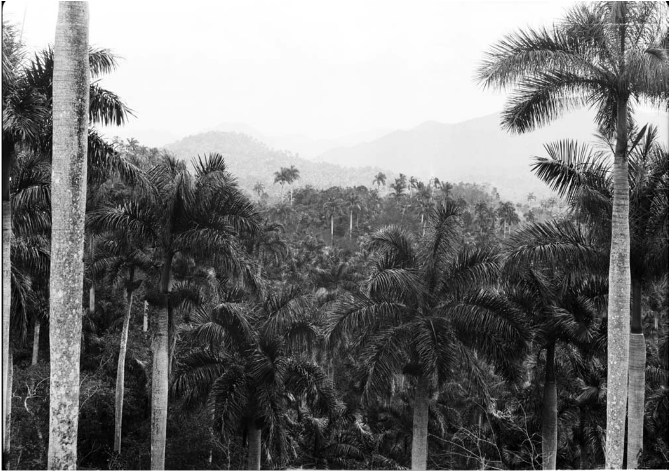
Figure 4 Forest of royal palms Roystonea regia . Sumner W. Matteson, 1904 (MPM 45124). Forests -- wet and dry, woodlands of mixed tree species and pure stands of palms, pines, or mangroves -- are the recorded habitat for a third of all West Indian terrestrial isopods.