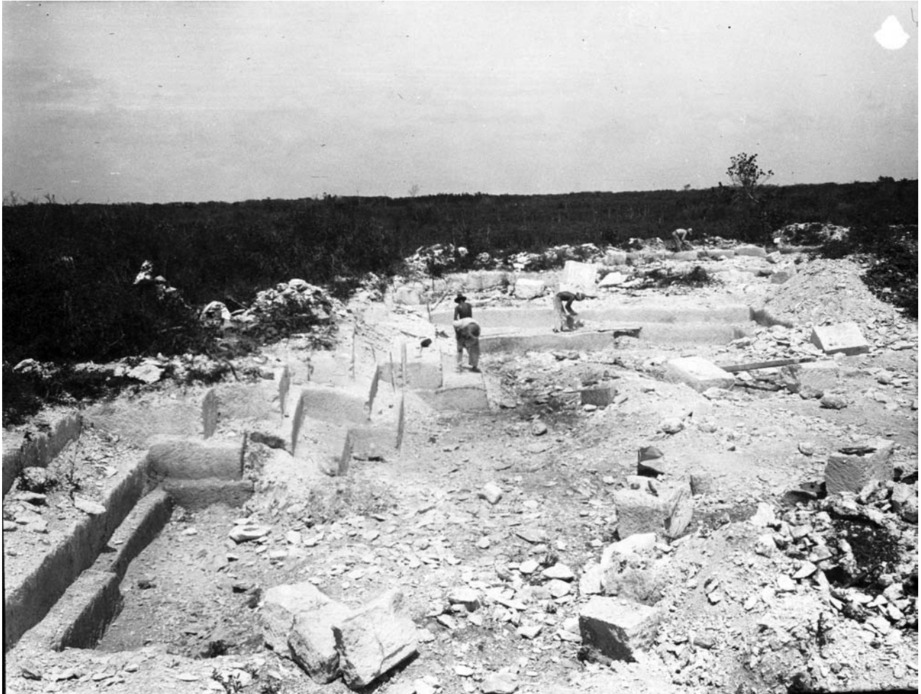
Figure 2 Cuban quarry. Sumner W. Matteson, 1904 (MPM 111786). The many limestone-rich regions of the landscape are home to a large number of the Cuban species described by Juarrero de Varona and Armas, including the type of Pseudarmadillo vansicklei (2003) from the Quarry Mella.