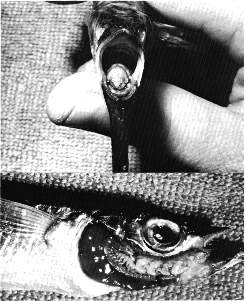
Fig. 25. Glossobius hemiramphi sp. n. in the mouth of a ballyhoo, Hemiramphus brasiliensis (Linnaeus). Upper figure, female in frontal view. Lower figure, female and male in lateral view; opercular flap and side of mouth removed to expose the isopods.

pereonites. Anterolateral corners of pereonite 1 produced laterally and anteriorly to form shoulders (fig. 1). Posterolateral corners of pereonites 1 to 5 obtusely rounded, those of pereonites 6 and 7 acute. Pereonite 7 not overlapping any pleonite. Coxae of pereonites 2 to 4 not enlarged or produced, those of pereonites 5 and 6 subtriangular in lateral aspect, that of pereonite 7