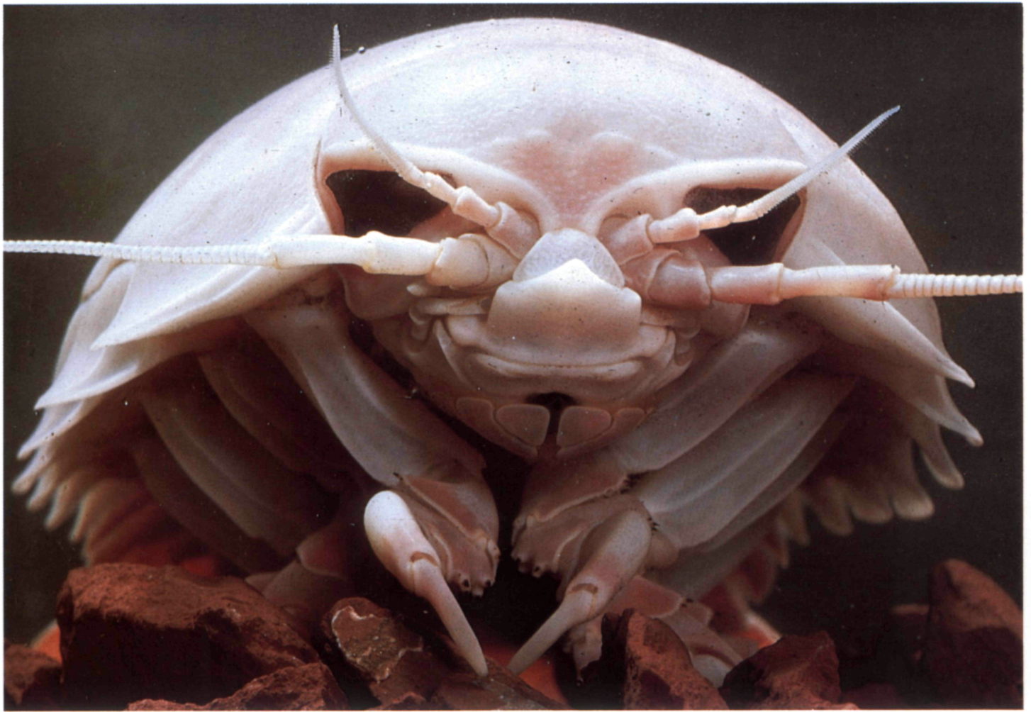
A juvenile that was successfully maintained at the New York Aquarium. The voracious and omnivorous Bathynomus uses its powerful mandibles to tear and cut apart its victims.

is a fossilized fragment dating from the middle Miocene epoch (15 million years ago) and discovered in the Okayama Prefecture of Japan. Two other Cretaceous (75 million years ago) isopod fragments, both placed in the extinct genus Pelaega , may also be bathynomids. One is from Bedfordshire, England, the other from a Texas formation. The fossil fragment of Pelaega guadalupensis indicates that the body length of this specimen approximated a juvenile B. giganteus in size, although it is not possible to determine the stage of development from the fragment. Unfortunately, isopods do not fossilize well, and it is impossible to ascertain with certainty the real taxo-